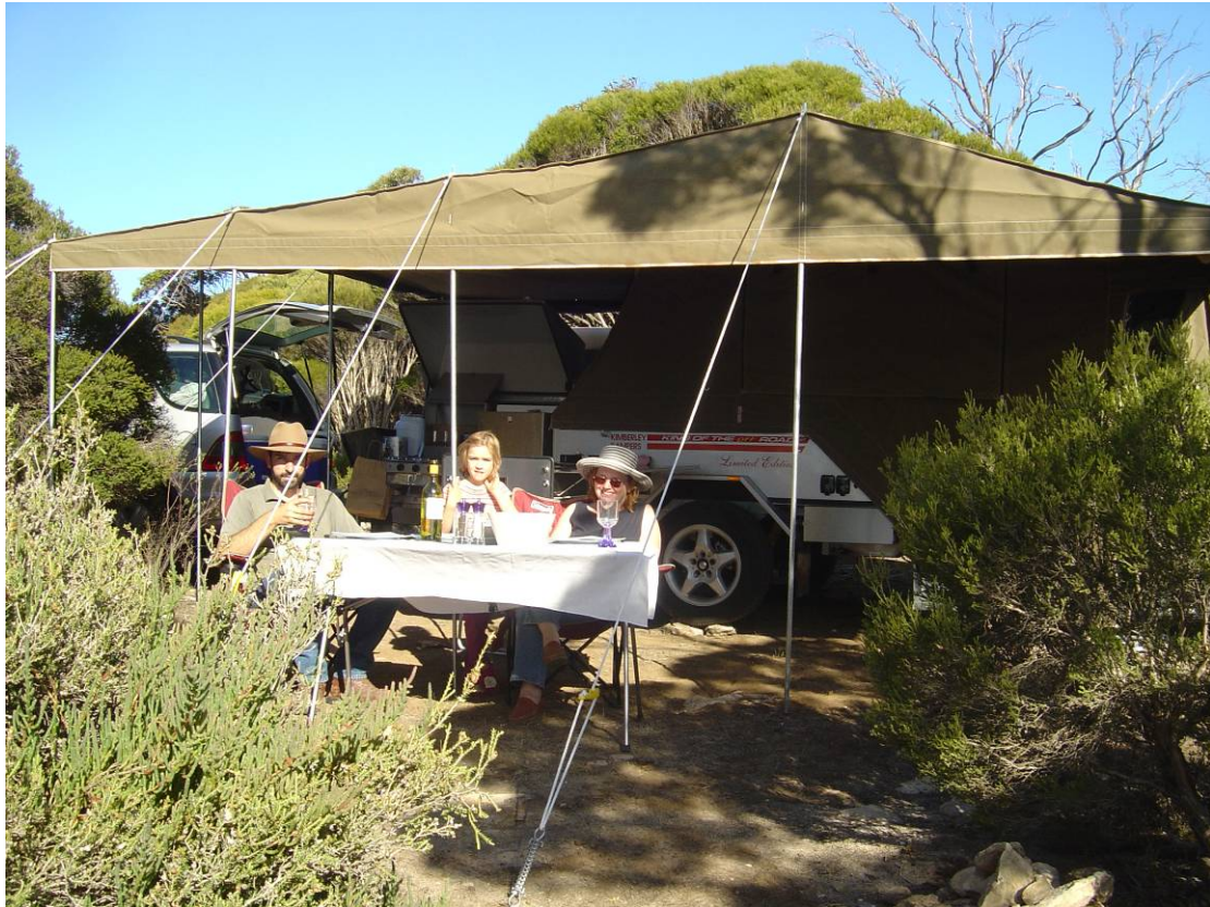
Plate 3 Camper Trailer at Sunset Lagoon private camp site

food are required. A camping site at Flour Cask Bay Sanctuary is included in the cost of hire.