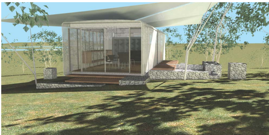
Plate 1 Innovative sustainable cabin design – Morris Nunn and Associates ©

Twelve fully self contained 4/5 star Eco-huts are proposed to be built. Eco-huts will comprise a mix of one, two and three bedrooms and will be flexible in design so that they can cater for a variety of family units ranging from couples to extended family groups. Each Eco-hut will be located so that it is secluded and private, set amongst the mallee woodland, with its own vehicle access,