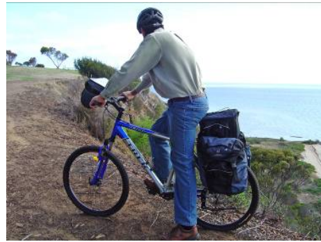
Plate 8 Bike touring

Providing bikes and canoes is part of a strategy to extend accommodation on the Sanctuary by offering quality outdoor experiences. Many of the existing tracks and trails are suitable for bikes. Some are suitable for biking and walking.