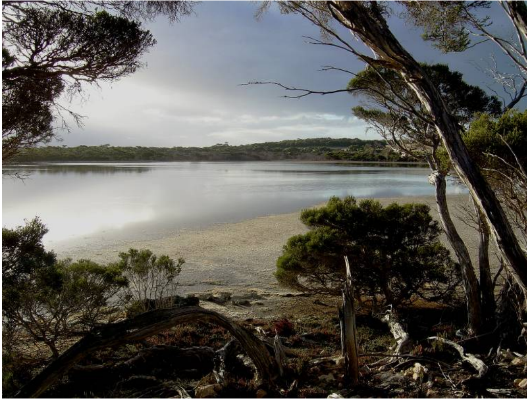
Plate 4 Sunset lagoon campsite

Additional Eco-huts will replace the proposed new Eco-camps if demand for Eco-camps proves to be inadequate.