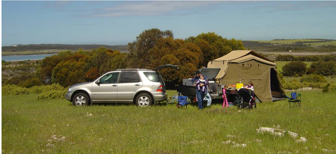
Plate 7 Camper trailer and Mercedes Benz 4WD package, Flour Cask Bay Sanctuary

Vehicle hire includes pick up and drop off at either the ferry or airport but can also be delivered to hotel accommodation at Kingscote, American River or Penneshaw.