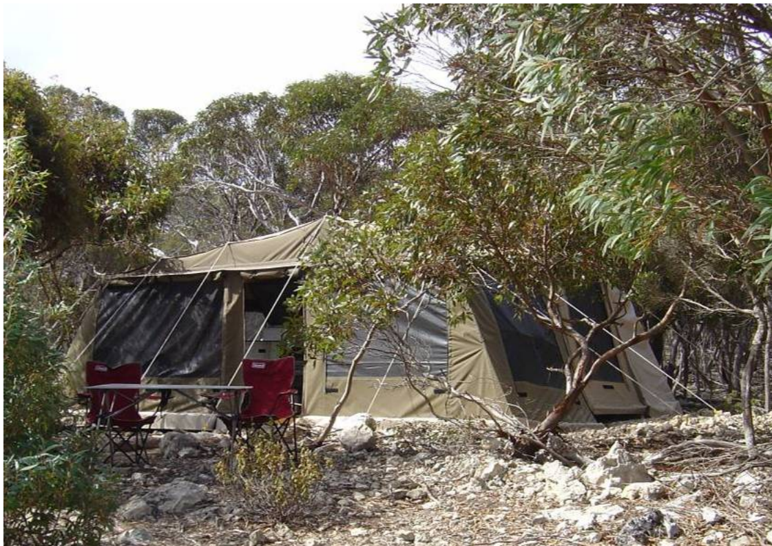
Plate 2 Rocky Ridge Eco-camp – Permanent hard floor tented accommodation

Flour Cask Bay Sanctuary currently provides quality camping equipment and venues including: