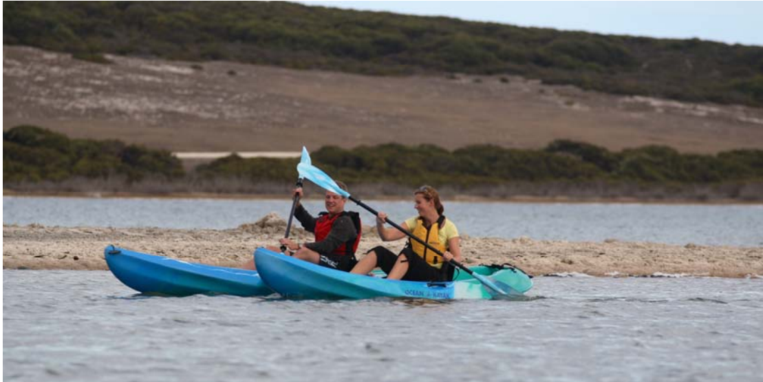
Plate 6 Canoeing on Salt Lake, Flour Cask Bay Sanctuary

The public picnic area is an important component of providing an opportunity for locals living in the Flour Cask Bay area and offers an opportunity to capture passing trade and increased exposure to the market. The picnic area will link to the main walking network. A short walking loop will lead to the Reception and Visitor Centre where public can find out more about the Sanctuaries' opportunities and services, access retail or plan outdoor activities such as canoeing or cycling.