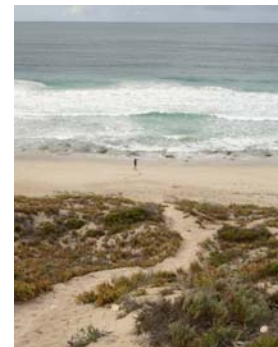
Plate 5 Existing beach access