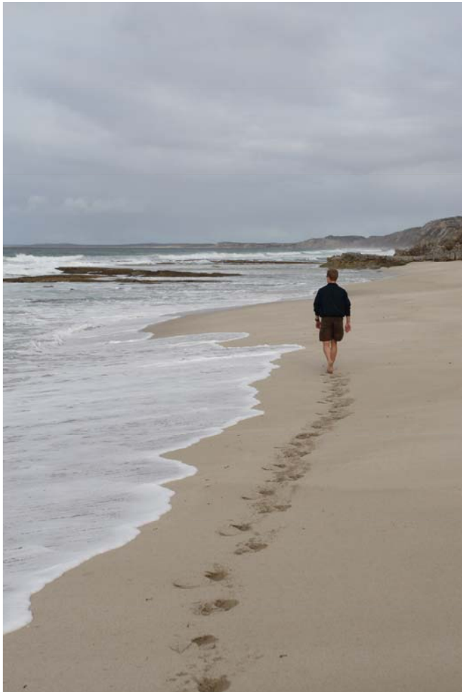
Plate 9 Trekking remote Flour Cask Bay

While the Sanctuary currently offers some short walking opportunities, there are plans to expand these to provide some longer half day walks based on the Sanctuary and the adjoining coastline. Sanctuary based activities encourage longer stays and improved occupancy while providing an improved sense of value. Guided walk opportunities including plant walks taking in some of the unusual and rare plants, star walks, bird watching on the wetlands and some