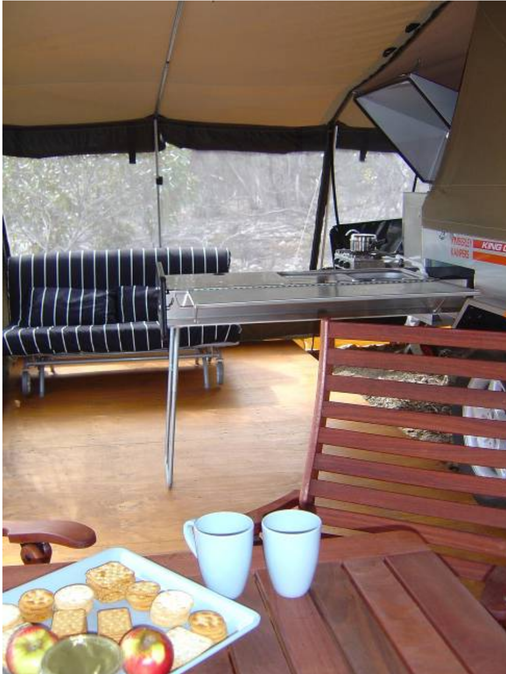
Plate 10 Eco-camp picnic hamper

be an important aspect of an optional bed and breakfast experience in the self contained Eco-huts and Eco-camps. The outdoor entertainment area will be available for catered meals on request. Menus will be diverse and flexible and vary seasonally to take advantage of seasonally available produce and pricing. Gourmet meal packs will allow guests to experience semi-catered meals incorporating local produce, for private first night arrivals, for picnics and barbeques or in gift baskets on departure.